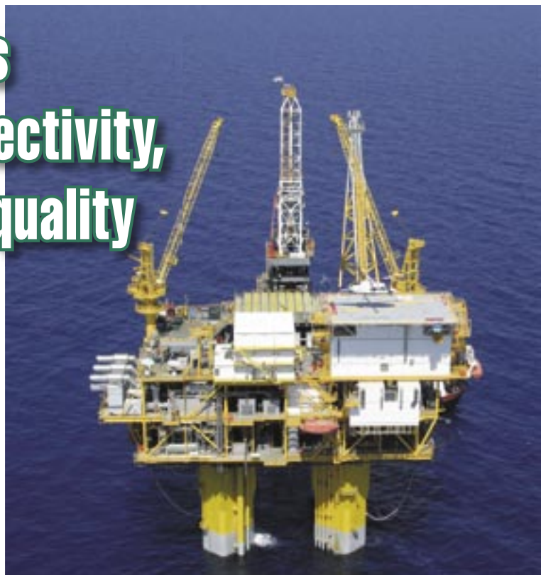
Anadarko-operated Marco Polo TLP.

B y using a novel approach that ties pre-stack seismic and well log data, our team has built a uniquely detailed 3D model of Anadarko's Marco Polo field, leading to a better understanding of the vertical and lateral extent as well as the quality of the reservoir.